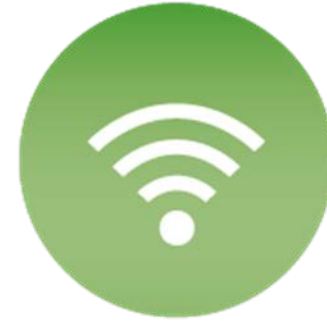
SAMHANDLENDE INTELLIGENTE TRANSPORTSYSTEMER